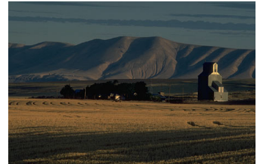
"Working together for a better future".

The CICP Program can be modified so that referrals to IHMS occur at day 30. This gives the hospital opportunity to correct classification errors. However, any delays can result in reduced benefits from the program.