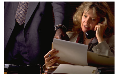
"Using a team approach to make a difference".

Often patients are placed in the CICP program when in fact they qualify for Medicaid. IHMS identifies these individuals and provides them the assistance they need. This program clearly demonstrates the hospital's desire to provide outreach to the community while increasing reimbursement.