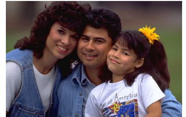
"Helping families get the assistance they need when they need it"

IHMS' discharged program used in conjunction with our in-house program offers hospitals the most complete review of self-pay patients for potential third party coverage. Together they create an effective process reducing bad debt, increasing Medicaid dollars, and strengthening the provider's relationship with the community.