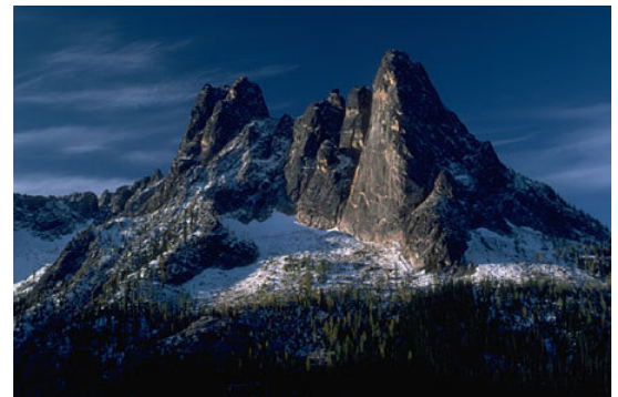
"Facing today's challenges and making a difference".

If there are any questions that haven't been answered in this brochure please don't hesitate to contact us.