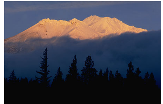
Working together for Success...

One of the key points of any IHMS service is the ability to customize a program to meet the needs of an individual client. Each of the programs can be adjusted to meet your needs. Many clients prefer to refer all self-pay accounts at the time of admission thereby realizing the full benefits of the program. This does not prevent a